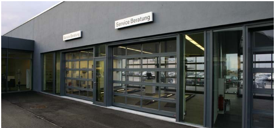
BMW subsidiary Leipzig