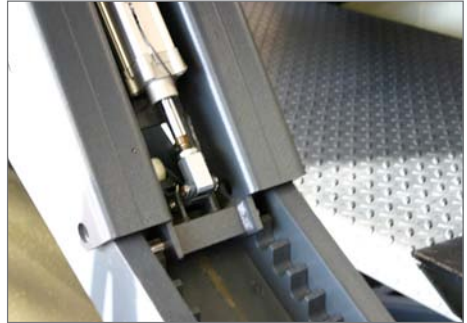
Dual adjustable safety ratchet system