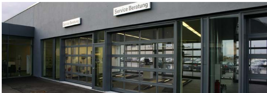
Acceptance area and consultancy service