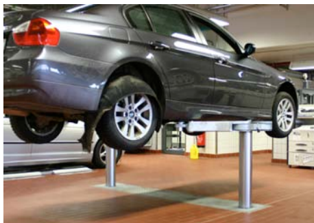
Top Lift 2.35 TSK