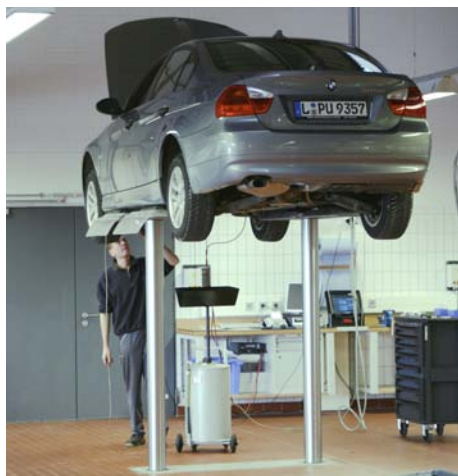
Top Lift 2.35 TS