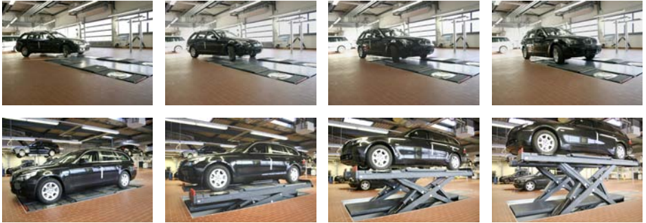
In-ground Installation of Uni Lift 4000 Plus BMW with pit and accessible floor compensation, make driving on also possible in cramped workshop.