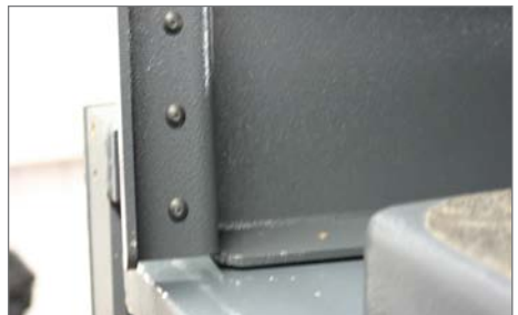
Plastic sliding knobs

Easily movable compensating elements at position of turntables, for balancing the different heights of runways. At its underneath, plastic sliding knobs are mounted, it avoids damages of painted surfaces and creation of corrosion.