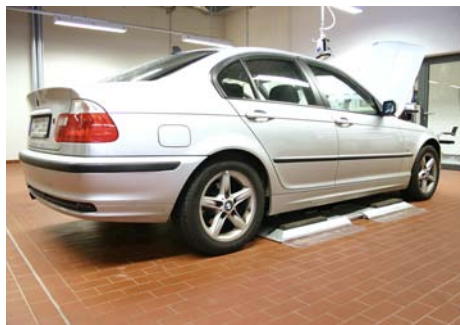
Top Lift 2.35 TS