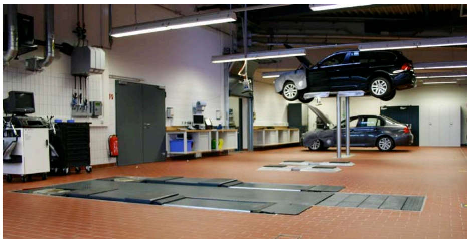
For wheel-alignment, the Uni Lift 4000 Plus BMW, is specially developed for BMW vehicles.