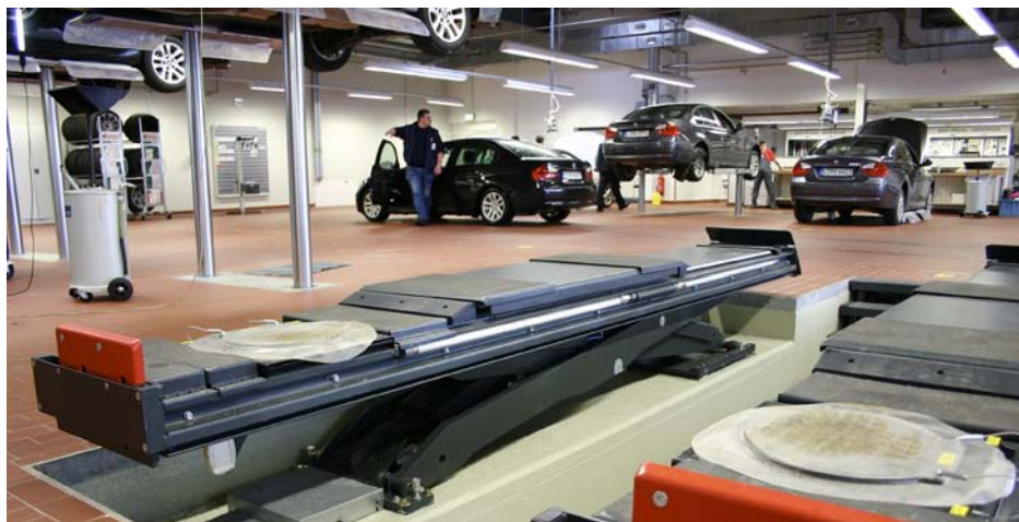
The workshop is equipped with a Top Lift 2.35 TSK, seven of Top Lift 2.35 TS, as well as, a Uni Lift 4000 Plus BMW