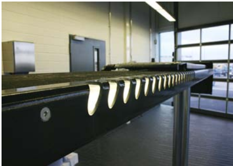
Upward adjusted, integrated lighting, in the runways.