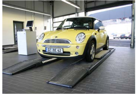
Acceptance area and consultancy service