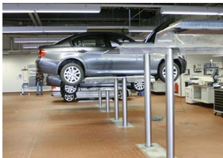
Top Lift 2.35 TS with length adjustable, and galvanized lifting platform