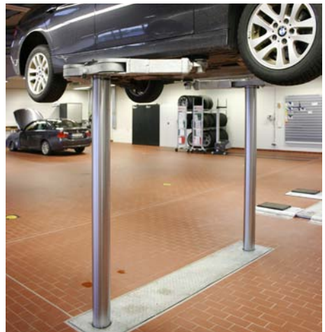
Top Lift 2.35 TSK-BMW

The subsidiary is configured with 8 in-ground lifts and a BMW's proved and released wheel-alignment lift in its workshop, as well as, 2 in-ground lifts in its acceptance.