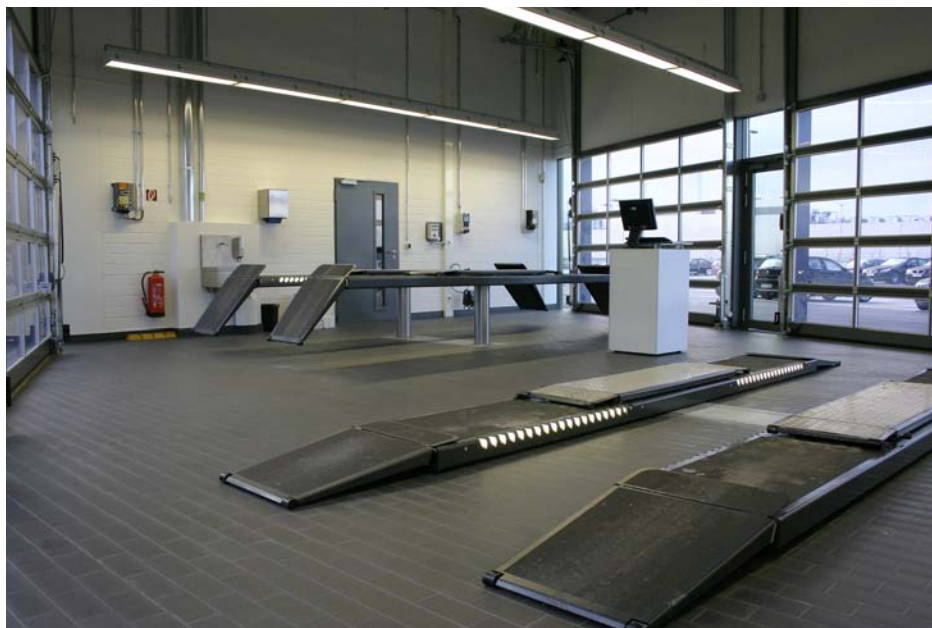
The new 2.32 TSAP · 2-pistons-lift with wheel-free lift, special flat and transversal runways