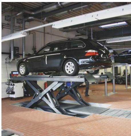
Uni Lift 4000 Plus in-ground installation with pit and accessible floor compensation