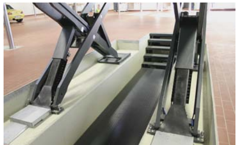
automatic floor compensation with stairs