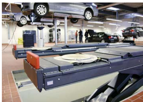
Turntables · vertical extend roll off protectors